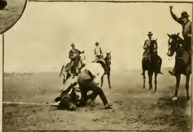
STEER DOWN AND TIED.